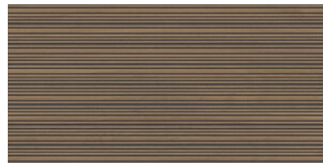
DURST ANTHRACITE MATE 60x120 XS RC PB