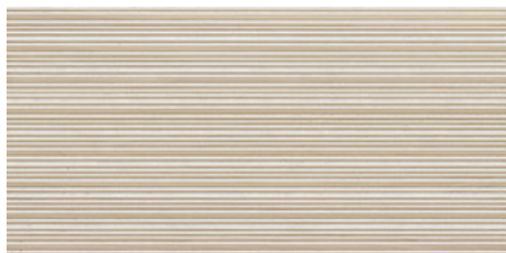
DURST MAPLE MATE 60x120 XS RC PB